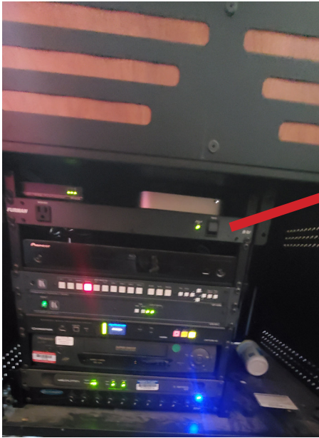
BluRay- Dvd Player/VHS Player Location - in the podium below the keyboard drawer.